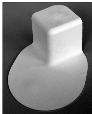
combined internal/external moulded corner

FLL tested, hot air weldable sheet, applicable as root and rhizome protection for extensive and especially for intensive green roofs.