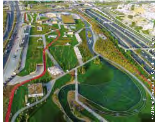
© Al Hami Construction & Trading company