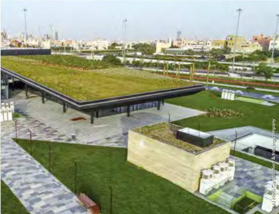
© Al Hami Construction & Trading company